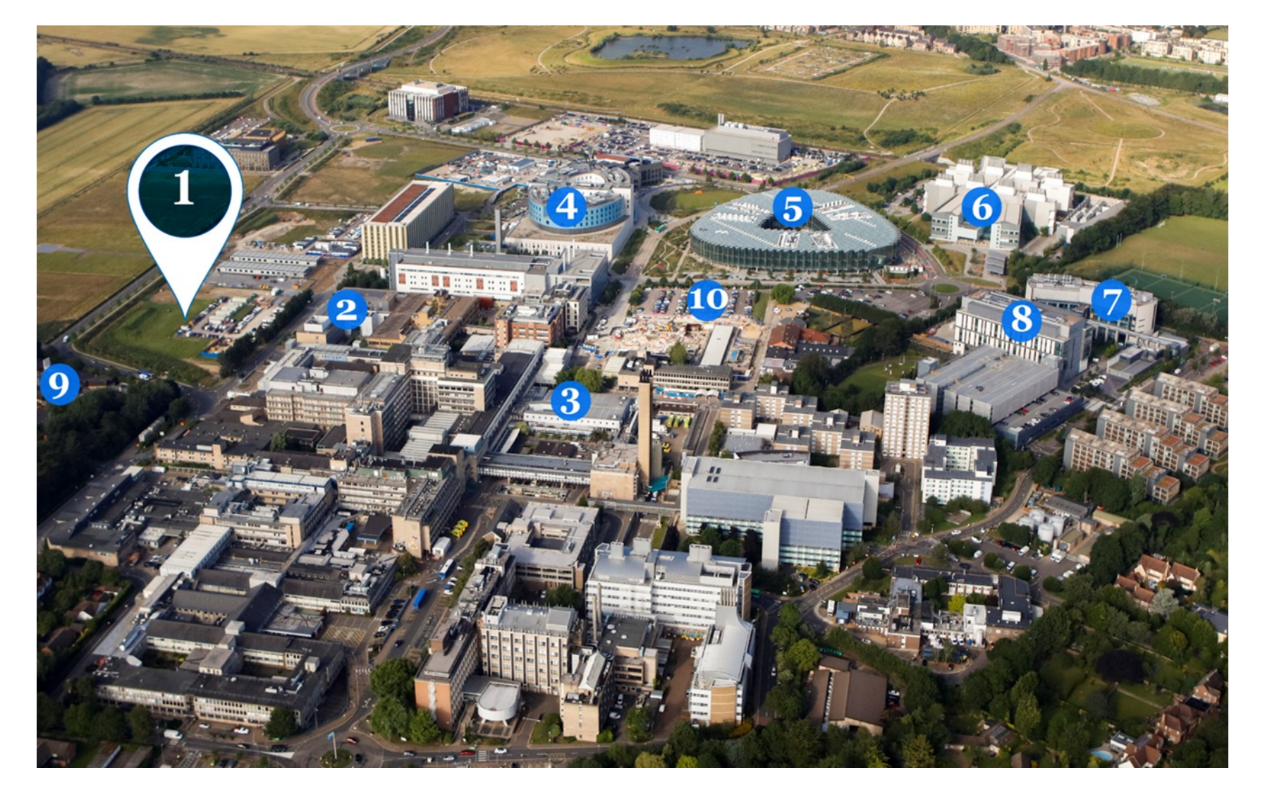
1 — CCH, 2 – The Rosie and NICU, 3 – Addenbrooke's, 4 – Royal Papworth Hospital, 5 – AstraZeneca, 6 – MRC Laboratory of Molecular Biology, 7 – Cancer Research UK Cambridge Institute, 8 – The Jeffrey Cheah Biomedical Centre, 9 – Forvie Site, 10 – Cambridge Cancer Research Hospital